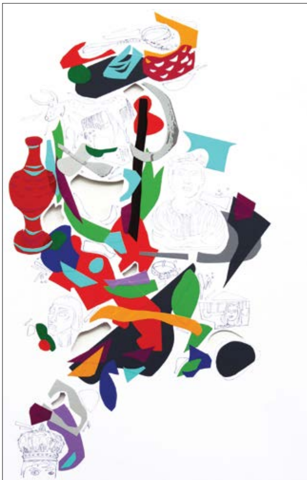
STATUES 2016 ( 31 X 47.5 cm ) PENCIL, COLOURED ADHESIVE FILM ON PAPER.