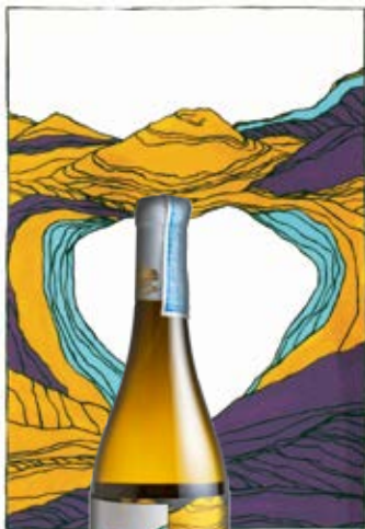
FEUDO MACCARI GRILLO TERRE SICILIANA I.G.P.