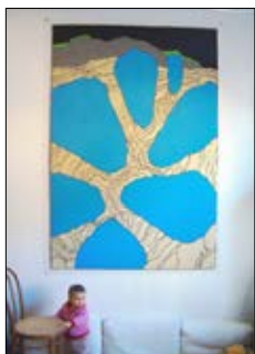
PAESAGGIO 1 / LANDSCAPE 1 2009 ( 150 cm x 240 cm ) ENAMEL ON TRANSPARENCY FILM.