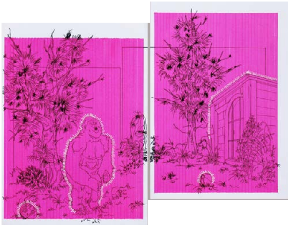
GORILLA'S GAME 2016

( 47 X 38 cm ) PINK HIGHLIGHTER AND PENCIL ON PAPER.