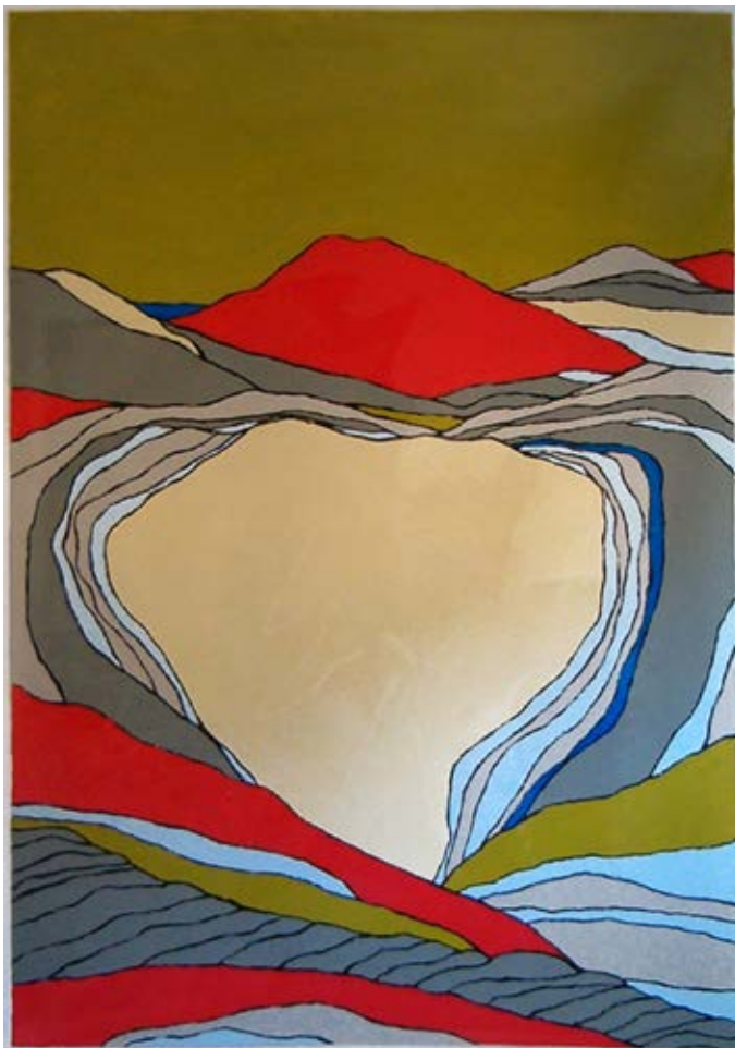
PAESAGGIO 2 / LANDSCAPE 2 2009 ( 150 cm x 240 cm ) ENAMEL ON TRANSPARENCY FILM.