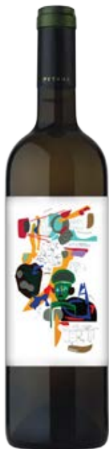
PITARS PINOT GRIGIO FRIULI GRAVE D.O.C.