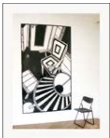
ROOM 2002 (148 x 255 cm ) ENAMEL ON TRANSPARENCY FILM.