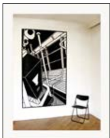
TRAM 2001 ( 148 x 249 cm ) ENAMEL ON TRANSPARENCY FILM.