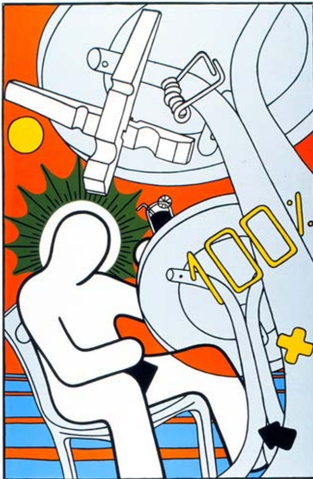
DRINK 2003 (150 x 230 cm) ENAMEL ON TRANSPARENCY FILM.