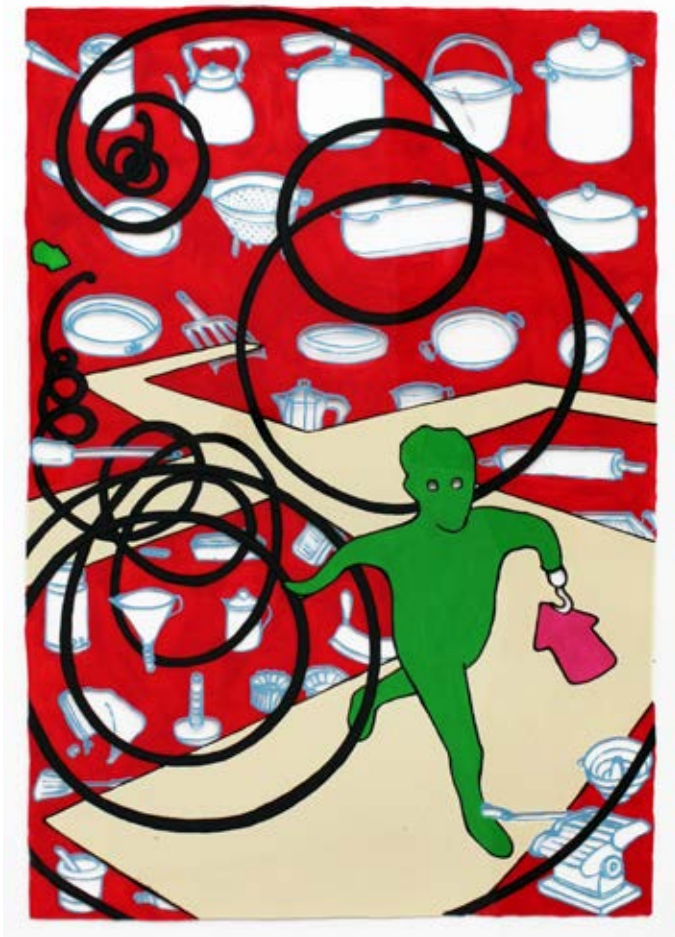
COOKING THE FUTURE 2008 (120 x 170 cm ) ENAMEL ON TRANSPARENCY FILM.