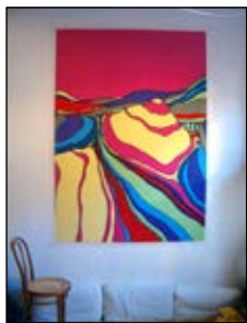
PAESAGGIO 3 / LANDSCAPE 3 2009 ( 150 cm x 240 cm ) ENAMEL ON TRANSPARENCY FILM.