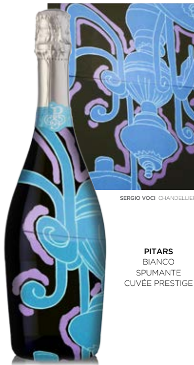
SERGIO VOCI CHANDELLIER

PITARS SERIS CHARDONNAY & SAUVIGNON FRIULI GRAVE D.O.C.