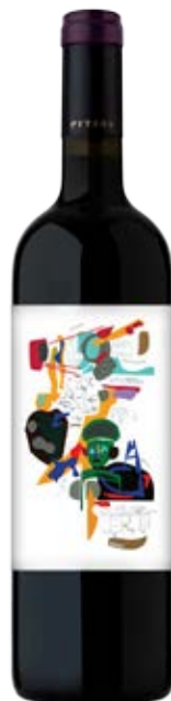
PITARS MERLOT FRIULI GRAVE D.O.C.