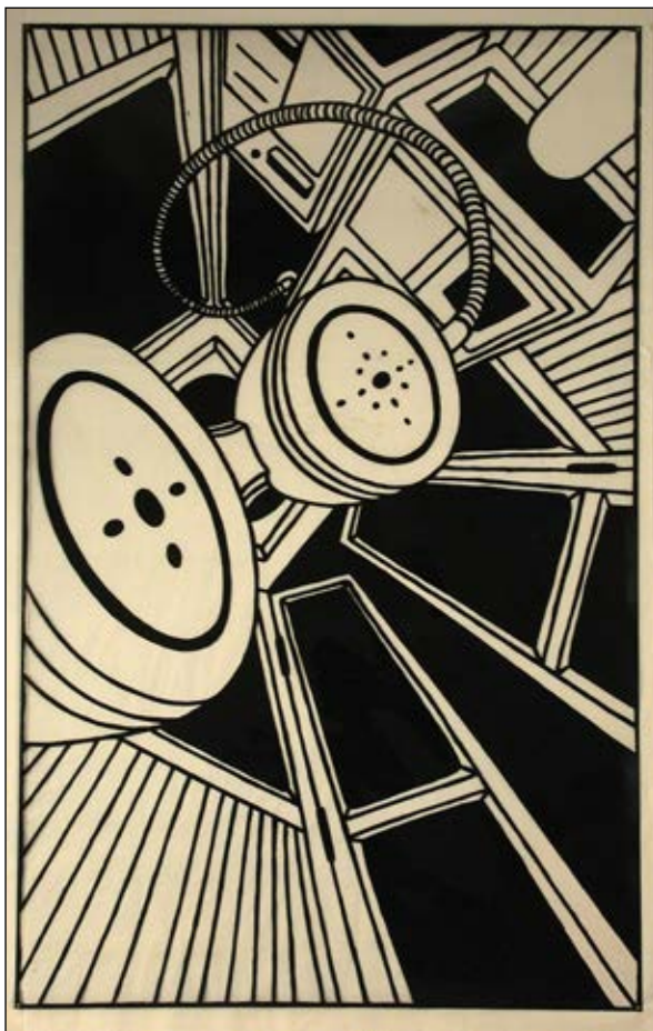
TELEFONO 2002 ( 148 x 232 cm ) ENAMEL ON TRANSPARENCY FILM.