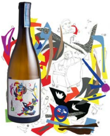
PIETRADOLCE ARCHINERI ETNA BIANCO D.O.C.